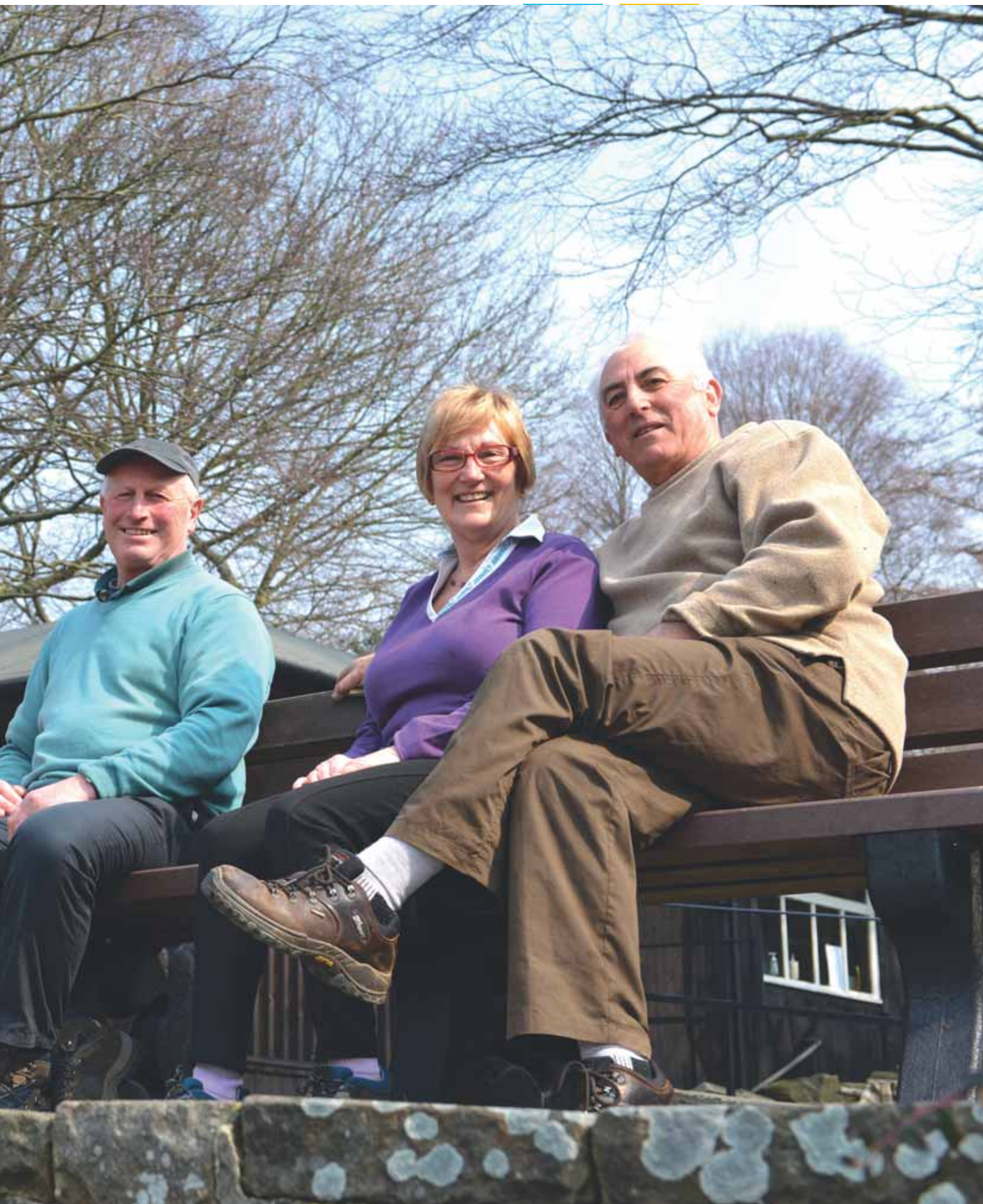
Product featured: Peak Bench