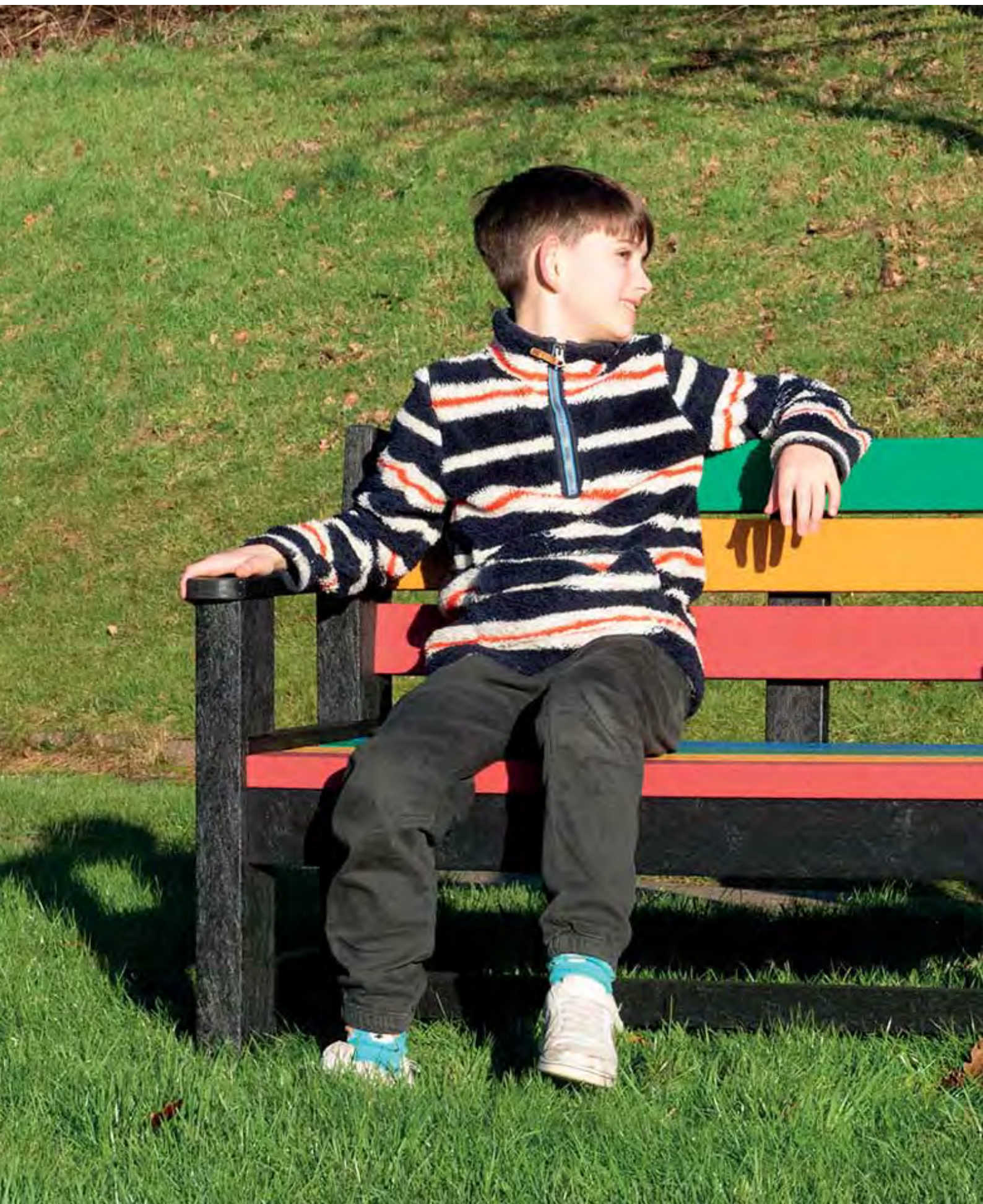
Product featured: Iguana 1.2